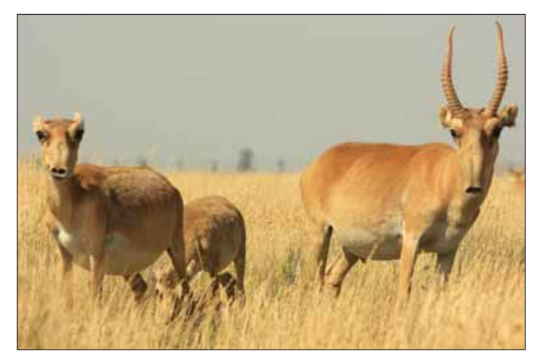
Figure 1. Saiga antelope (Saiga tatarica).

offsets to actively consider the uncertain and dynamic nature of conservation targets when specifying baselines and evaluating future conservation outcomes.