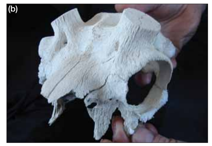
Figure 2. (a) Recent trends in abundance for the Ustyurt saiga population, which is declining despite the presence of a protected area in the Uzbek portion of its range. (b) A saiga that was poached for its horn in its Uzbek winter range, in an area without effective protection.

boundary population inhabiting the Ustyurt Plateau, which spans the border between Kazakhstan (where the population summers) and Uzbekistan (where it migrates to during winter).