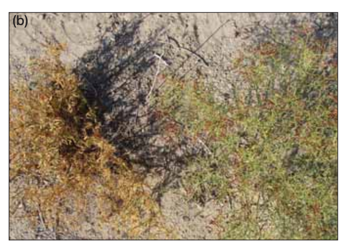
Figure 3. Evidence of environmental change. (a) The Uzbek Ustyurt Plateau in late winter. Winter temperatures have trended upward over the past 30 years. (b) Alhaji spp (right), an excellent livestock forage crop, alongside Piganum spp (left), a poor forage crop and an indicator of rangeland degradation.

throughout their winter range will likely continue. Therefore, while the offset would not promote additional biodiversity, it would prevent impacts from multiple sources unrelated to oil and gas activities, thereby avoiding potentially substantial projected losses.